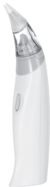
Battery Operated Nasal Aspirator